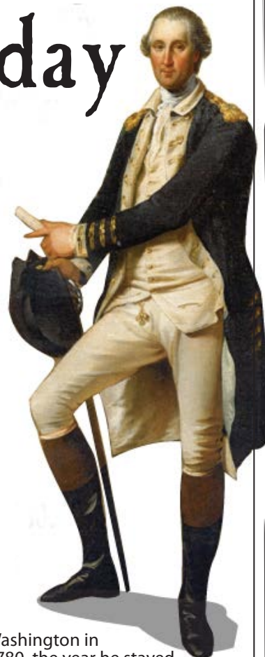
Washington in 1780, the year he stayed at the Steuben House for 14 days in the Steenrapie Encampment