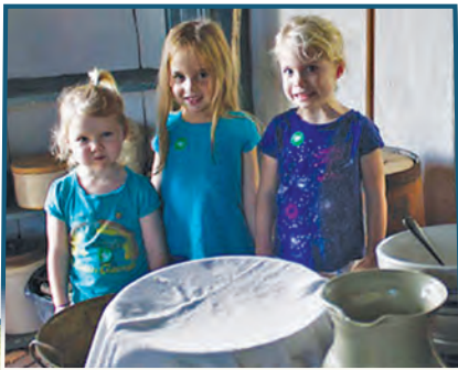
From top: two boys made tricorn hats and George Washington puppets for Washington's Birthday , a crowd gathers by the Out Kitchen at Baronfest , reading the HNBL/Rev War interpretive panel by the Hackensack River, three girls peeked at bread rising in the Out Kitchen , and making corn husk dolls by the Demarest House at Under the Shad Moon .