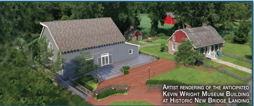
ARTIST RENDERING OF THE ANTICIPATED KEVIN WRIGHT MUSEUM BUILDING AT HISTORIC NEW BRIDGE LANDING

We are celebrating getting past a major hurdle with obtaining the DEP Permit. The new Museum is really happening at Historic New Bridge Landing.