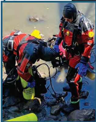
THE CANNON, "OLD BERGEN", WHEN IT SAT IN FRONT OF THE STEUBEN HOUSE. DIVERS PREP BY THE BRIDGE TO SEARCH IN THE HACKENSACK RIVER.

WE APPLIED FOR AND RECEIVED A $6,000 GRANT FROM AMERICANA CORNER, A PRIVATE FOUNDATION, FOR CONSERVATION OF THE CHARLEVILLE MUSKET. THE MUSKET WAS REPORTED TO HAVE BEEN RETRIEVED NEARBY THE STEUBEN HOUSE ALONG THE HACKENSACK RIVER BY A BOY IN 1915. THESE GUNS WERE IMPORTED BY THE THOUSANDS FROM THE FRENCH, AND FACILITATED BY LAFAYETTE. CONSERVED AND STABILIZED BY GARY MCGOWAN OF CPR, PICATINNY ARSENAL'S HISTORY DEPARTMENT WENT ON TO EXAMINE AND X-RAY IT (IT'S 52-1/2 INCHES LONG!) REVEALING MORE ABOUT IT. THAT REPORT IS FORTHCOMING.