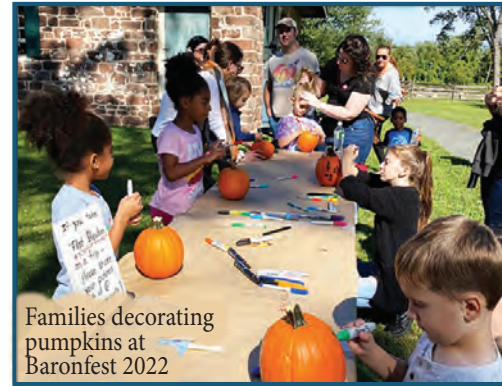
Families decorating pumpkins at Baronfest 2022