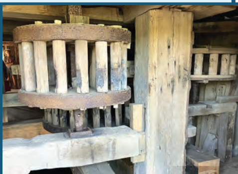
INSIDE THE MILL: SOME OF THE HANDMADE WOOD GEARS THAT TURN TO RUN THE TIDE MILL. NOTICE THE WEAR FROM YEARS OF USE

UPCOMING ARCHAEOLOGICAL PROJECTS, MADE POSSIBLE WITH FUNDING TO THE HISTORIC NEW BRIDGE LANDING STATE PARK COMMISSION FROM THE STATE OF NJ, WILL REVEAL MORE INFORMATION ABOUT OUR MILL & OUR INLAND SEAPORT, NEW BRIDGE LANDING.