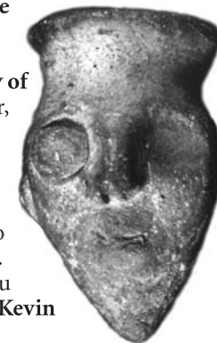
Effigy pipe found in Hackensack in 1871