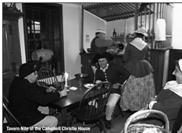
Tavern Nite at the Campbell Christie House