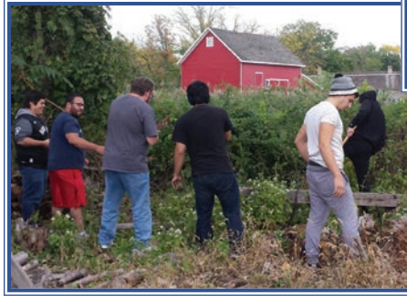
Cleaning the grounds.

Join us at one of our monthly School of Interpretation meetings and find out what it's all about.