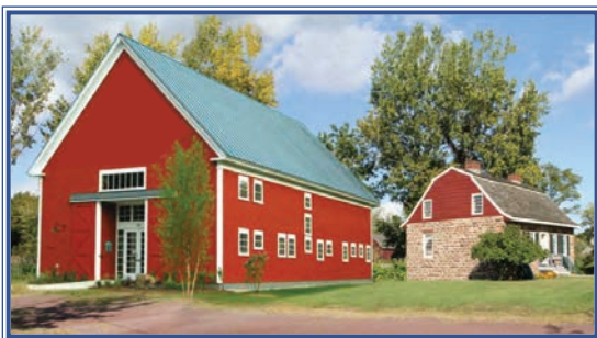
Artist rendering of museum by Campbell-Christie House