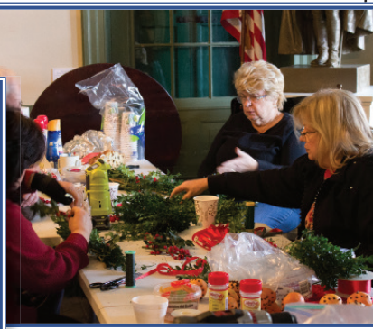
BCHS members create traditional Bergen County Dutch holiday decorations for the Annual BCBS Christmas Concerts.