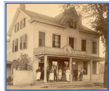
SCHLOSSER'S CLUB HOUSE CIRCA 1880