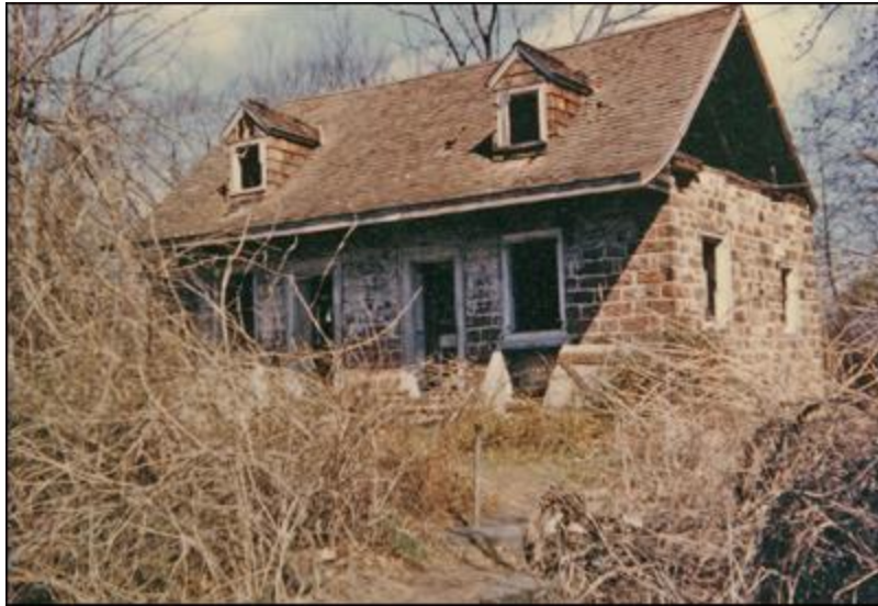
The Steuben House still stands on its original location. Photo of the Demarest House when located in New Milford.