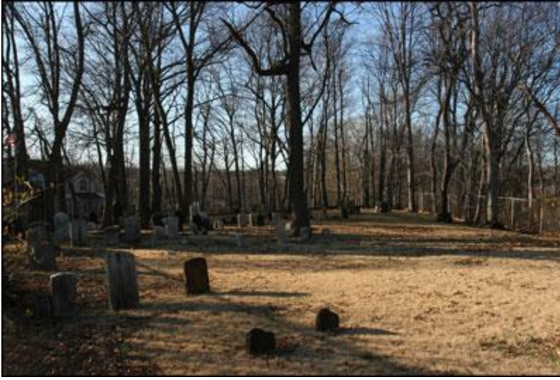
French Huguenot – Demarest Cemetery