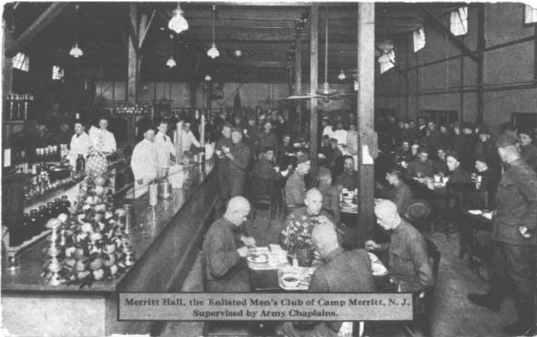
Merritt Hall, the Enlisted Men's Club of Camp Merritt, N. J. Supervised by Army Chaplains.