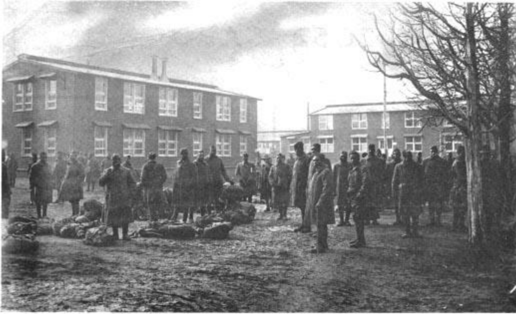
Colored Victory Boys, Camp Merritt, N. J.