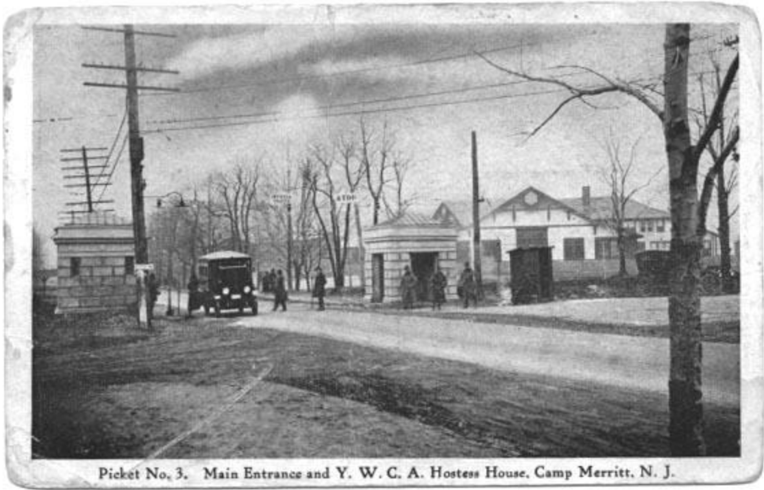
Picket No. 3. Main Entrance and Y. W. C. A. Hostess House, Camp Merritt, N. J.