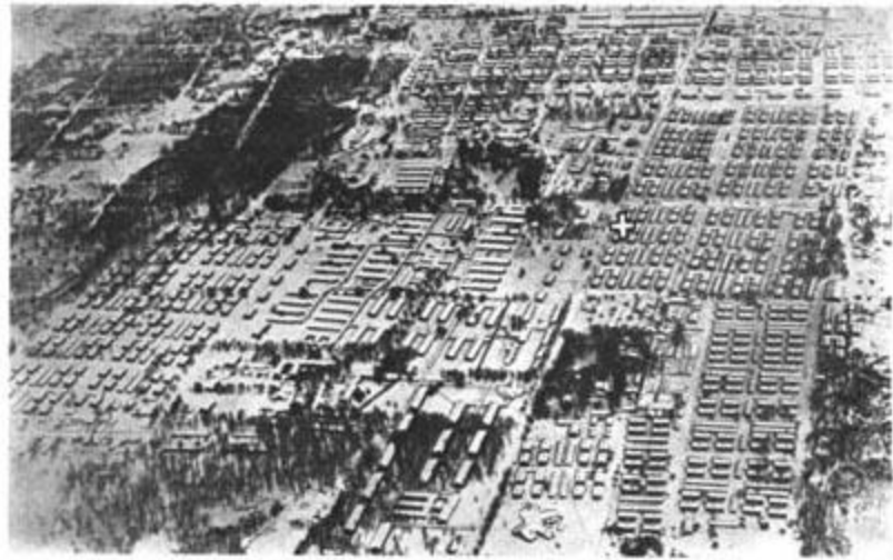
An plane view of Camp Merritt 1919 THIS INDICATES LOCATION OF BASE CAMP

7. Postcard, Picket No. 3, Main Entrance and YWCA Hostess House,