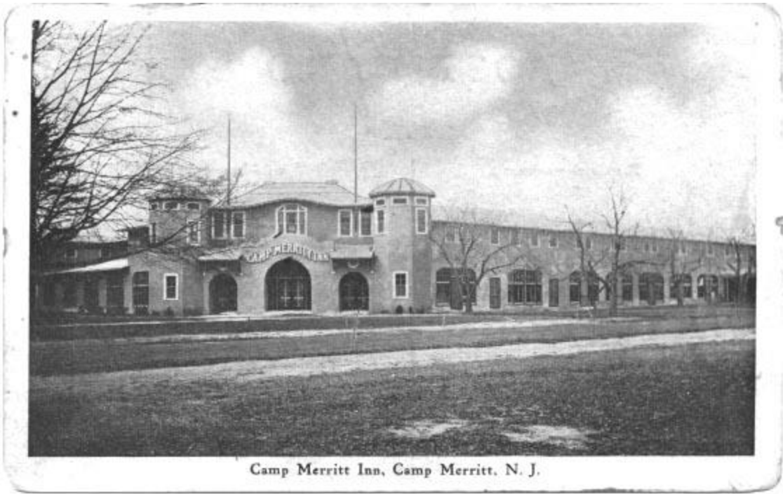
Camp Merritt Inn, Camp Merritt, N. J.