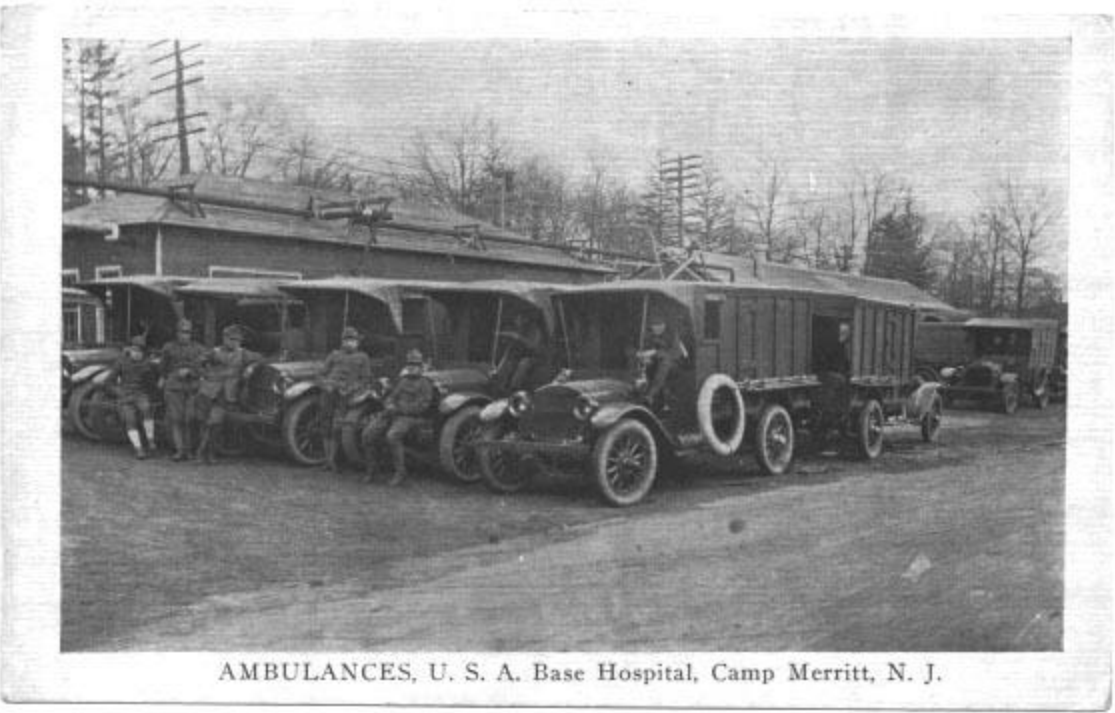
AMBULANCES, U. S. A. Base Hospital, Camp Merritt, N. J.